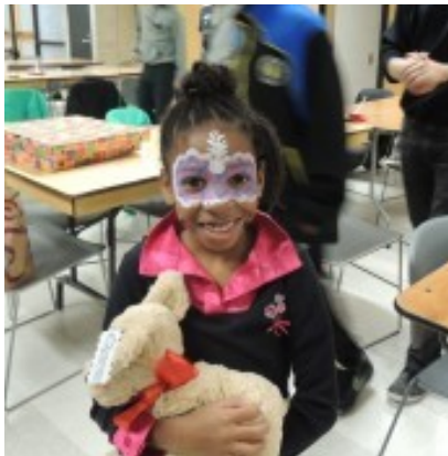
Christmas party face painting

Against this sadness, we position our happiness at helping one another to survive our experience of abuse and to grow far beyond it to become the powerful authors of our own lives. We delight in our ability to bring joy to one another and to our children, our ability to live true to ourselves, our ability to realize our own ambitions and to help our children realize theirs, to grow together and celebrate together, and to help more and more women and children do the same.