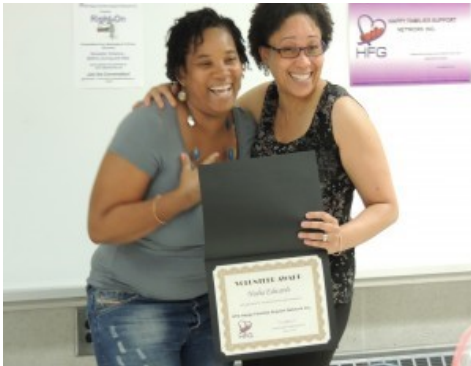
2014 Volunteer Appreciation Luncheon

It was a time of growth at HFG Happy Families Support Network Inc.!