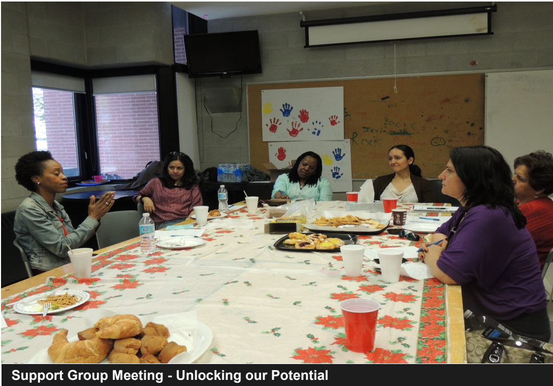
Support Group Meeting - Unlocking our Potential

Our support group meetings and workshops are designed so that our moms can help each other while benefitting from the expertise and experience of outside facilitators, including life coaches, self-defense instructors, psychologists, human resources experts, nurses, and more.