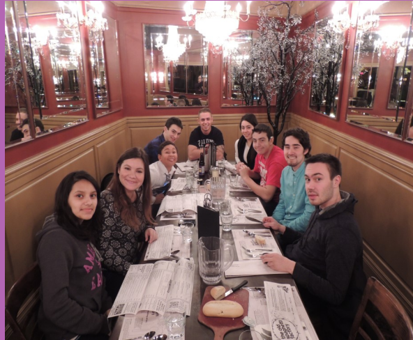
Volunteer Christmas Dinner

Speaking of dedicated volunteers, our team of wonderful young people does an amazing job with the Children's Program. They give of their time and energy every month and the children love them and love all the wonderful activities and games they facilitate. The moms really